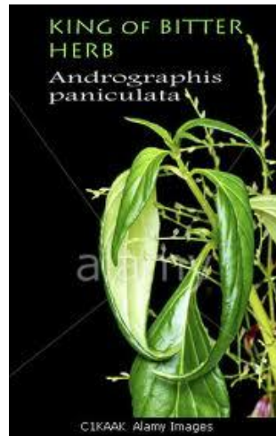
King of Bitterness